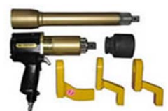
Extension Kit: 15" & 18" with fixed additional reaction arm options. Connects to standard tool.