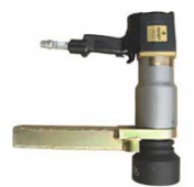
Straight leg long reach Reaction arm