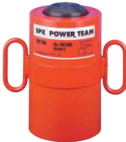
30, 60, 100, 150, 200 Ton Double-Acting Models Feature Plain Collar