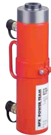
30, 60, 100 Ton Double-Acting Models Feature Threaded Collar